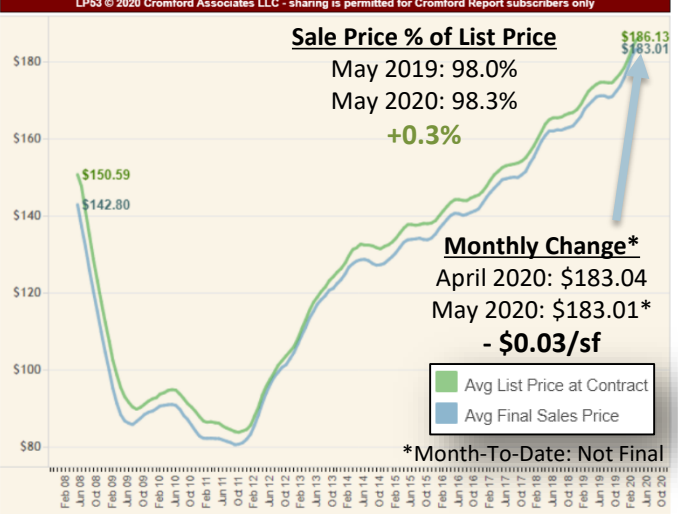
List Price and Sales Price per Sq Ft - 6 Month Average Greater Phoenix - ARMLS Residential Resale - Measured by Calendar Month Last Update 5/24/2020 5:28:01 AM

Sales price per square foot trends do not immediately respond to shifts in supply and demand due to the length of the sales cycle. It takes anywhere from 3-6 months to see a response in price appreciation as the market must first wait for responses in list prices, listings under contract and finally sales to record.